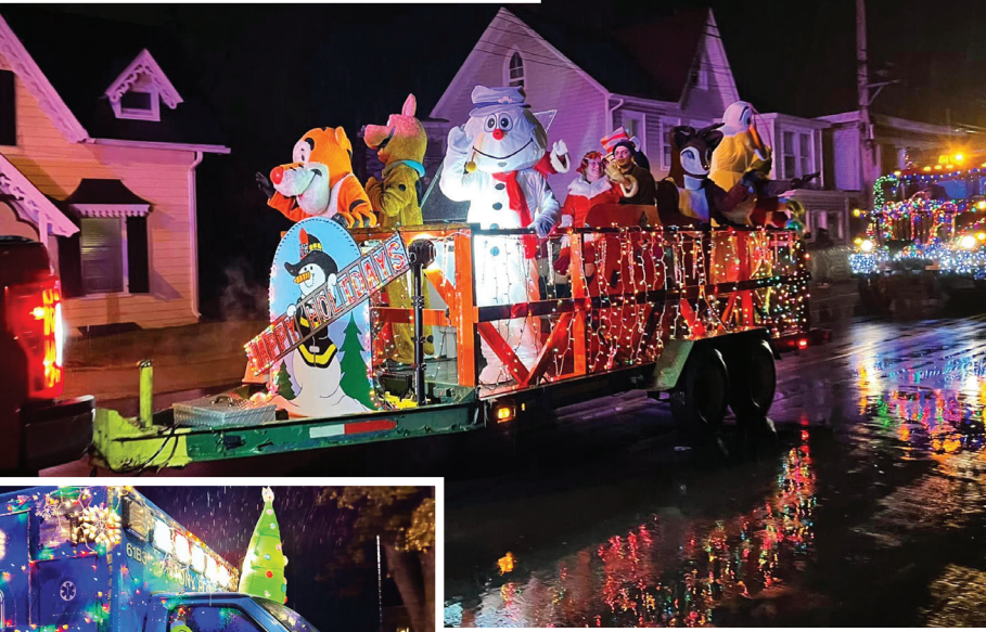
Over 50 floats and vehicles participated in the Light Up Stony Point Holiday Parade!