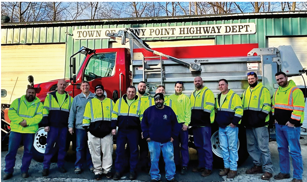
Stony Point Highway Department employees standing in front of the newly purchased truck.

15 Rose Street, Stony Point, NY 10980 Phone: 845-786-2300 E-mail: highway@townofstonypoint.org Hours: Monday–Friday 7:00 am–3:30 pm Saturday 9 am–1 pm (except holidays)