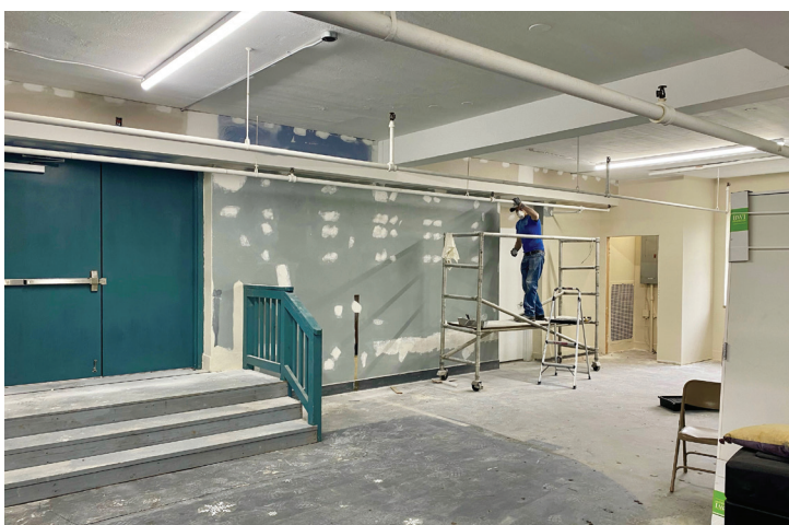
A fresh and clean new look for the ground floor of Kirkbride Hall!