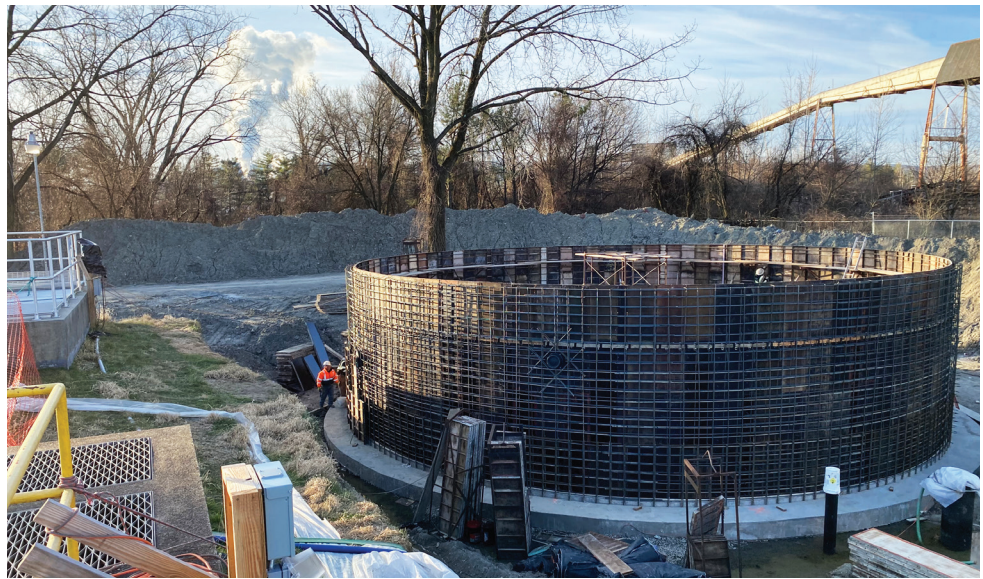
The second of two new clarifier tanks under construction at the Wastewater Treatment Plant.