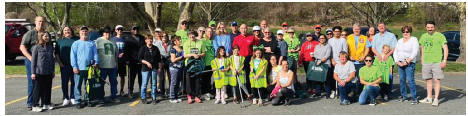
2023 Stony Point Clean Up participants getting ready to clean up the town! Join us on April 20th for the 2024 Clean Up!

15 Rose Street, Stony Point, NY 10980 Phone: 845-786-2300 E-mail: highway@townofstonypoint.org Hours: Monday-Friday 7:00 am-3:30 pm Saturday 9 am-1 pm (except holidays)